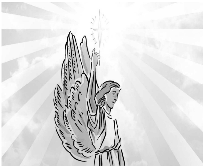
St. Michael and all Angels